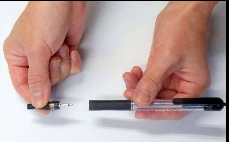
You can choose type and frequency as the cartridge type