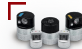
Optic adapters for 4 mm and 6 mm probes

Designed for applications starting at Ø 6 mm. Especially useful for weld seam inspections, heat exchanger inspections, plant maintenance, construction supervision, FOSAR, personnel search as well as military and security technology. The VUCAM XO/XO+ is available in probe lengths from 2.2 m to 6.6 m and offers three optional optic adapters.